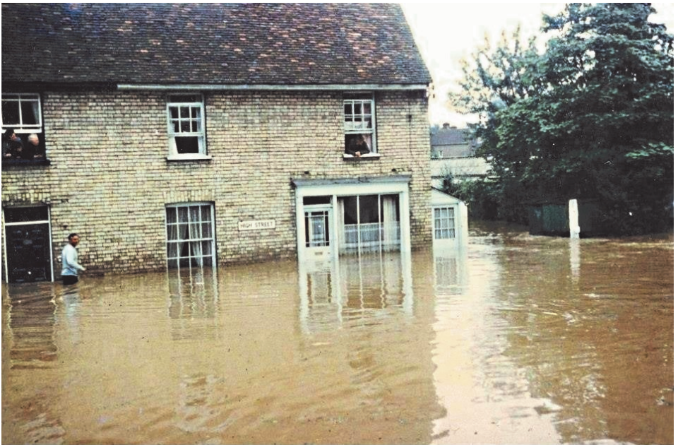
FRANK AYLOTT WADING AT THE FRONT OF THE HOUSE