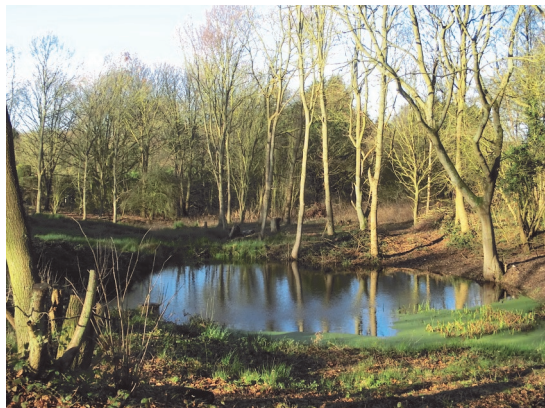
A pond on Patmore Heath at Albury.

Amphibians such as frogs, toads and newts need to lay their eggs in water but will spend much of their adult lives on land, eating a range of garden pests if there is some dense vegetation and a rockery nearby. These creatures have become quite scarce in the wider countryside due to the reduction in suitable habitats.