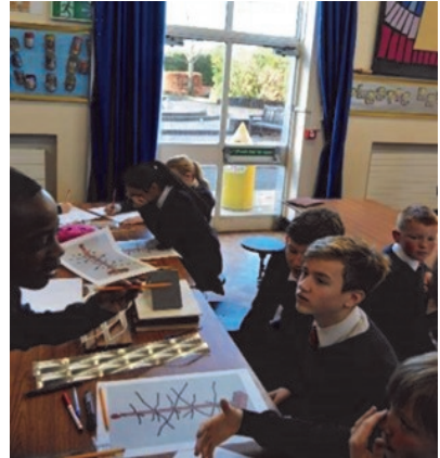
Above & below: Millennium Garden House competition.